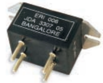
Series 006 J/K

These reliable ERI I/O modules provides an electrically clean, photo-isolated (2500 VRMS min; 4000 VRMS optional), noise-free interface between programmable controllers, microprocessor and computerized machine controls and external element such as limit switches, thermostats, pressure switches, motor/motor starters, valves and heaters.