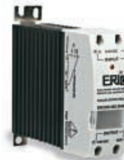
Series 030 DIN