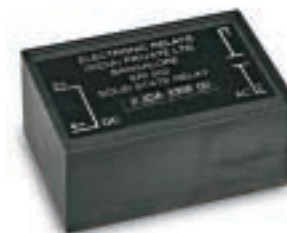
Series 002 J/K