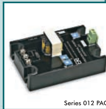
Series 012 PAC