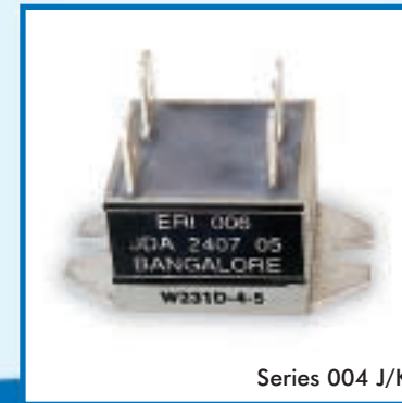
Series 004 J/K