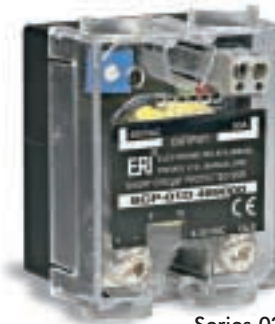
Series 020 SCP

The people at ERI are a team of well-qualified and committed group that has enabled it to reach a high level in technology and customer satisfaction. Their expertise is nurtured with regular training sessions. Teamwork is encouraged at all levels complimented with regular campaigns for the importance of environment friendly practices. ERI prides itself for being an equal opportunity employer, where every person is given equal opportunities to grow and develop.