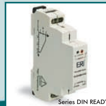
Series DIN READY

Currently Working on ROHS Directive - 2002/95/EC Standards