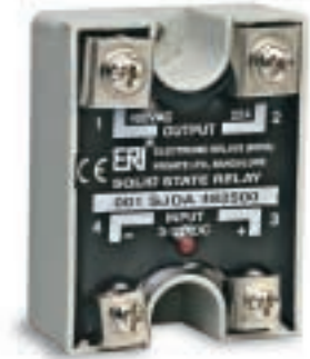
Series 001 J/K