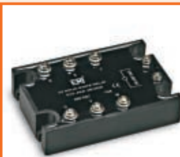
Series 012 J/K